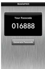
ZyWALL OTPv2 Mobile Token (OTP-MOBI)